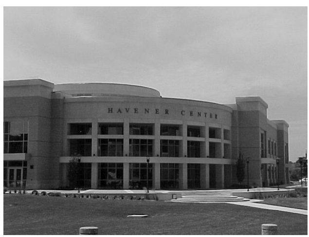
The new student union building, Havener Center, opened on the UMR campus in January 2005.

The University of Missouri-Rolla is in its 136th year as one of the nation's premier universities for science and technology. But while UMR's reputation has been for the quality of its engineering program, it is quickly becoming a well-rounded institution that now offers undergraduate and graduate degree programs in 35 fields.